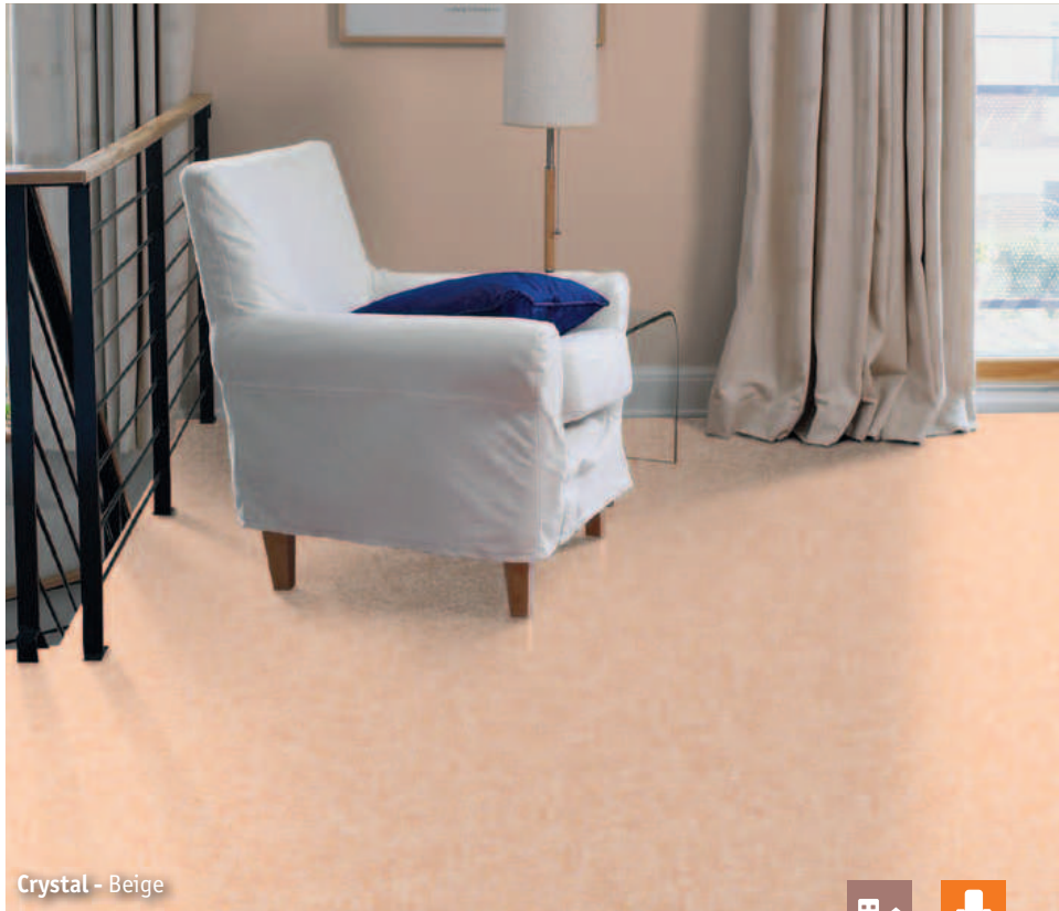
Crystal - Beige